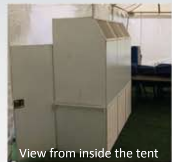
View from inside the tent